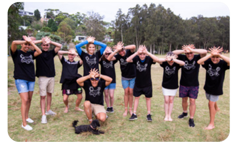
Aboriginal-On Track' workshop in progress