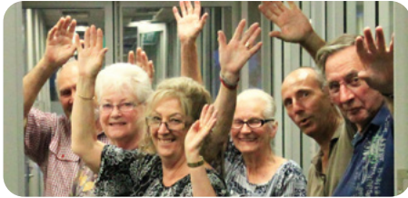
'You're Not Alone' Substance Abuse Support Group