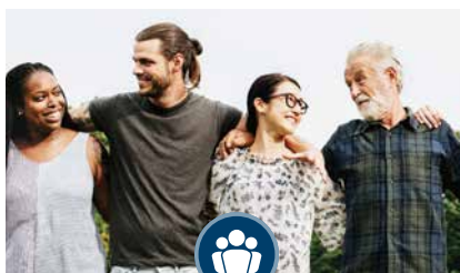
Population Health Priorities