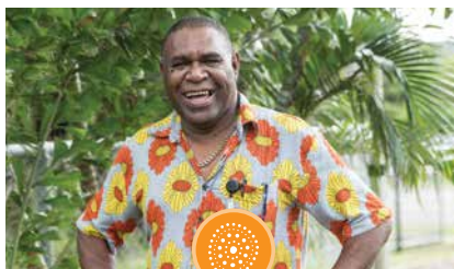
First Nations Health