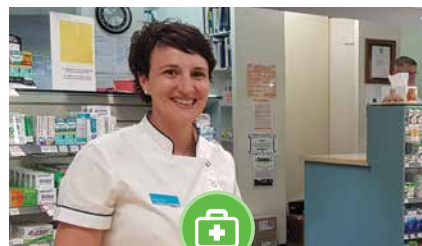
GPs and other Primary Care Professionals